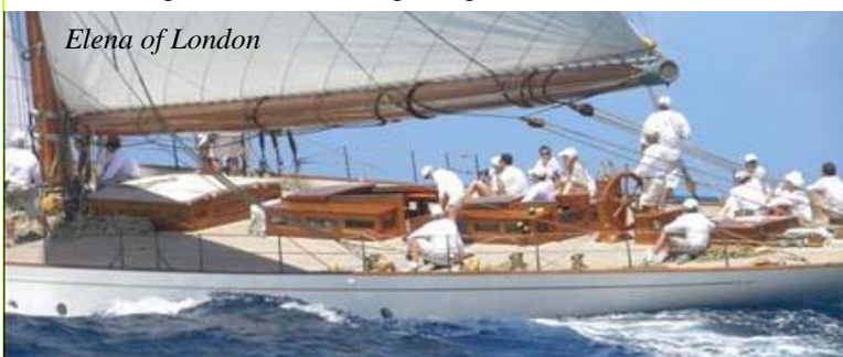
Elena of London